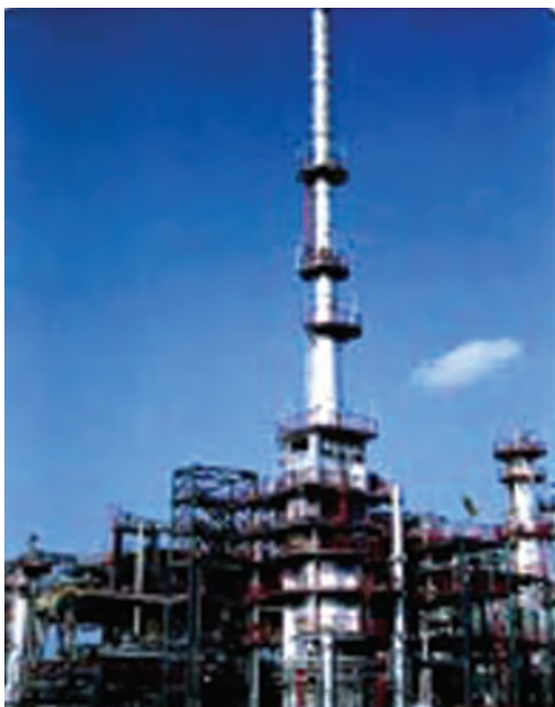
Fig. 5.5: A petroleum refinery

separating the various constituents/ fractions of petroleum is known as refining. It is carried out in a petroleum refinery (Fig. 5.5).