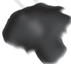
Fig. 5.3: Coal tar

It is a black, thick liquid (Fig. 5.3) with an unpleasant smell. It is a mixture of