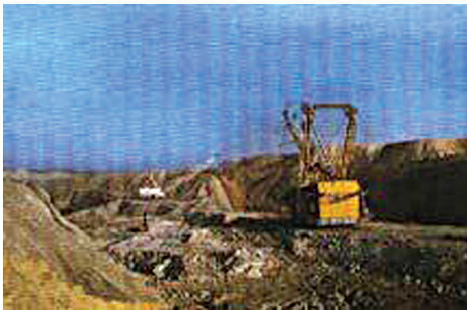
Fig. 5.2: A coal mine

When heated in air, coal burns and produces mainly carbon dioxide gas.