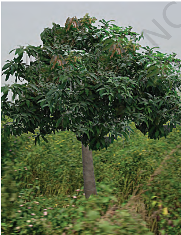
Fig. 7.3 (a) : Wild Mango

Madhavji shows sal and wild mango (Fig. 7.3 (a)) as two examples of the