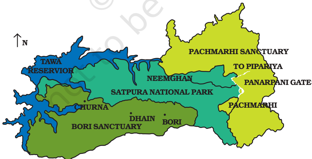
Fig. 7.1 : Pachmarhi Biosphere Reserve