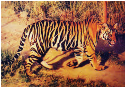
Fig. 7.4 : Tiger

Tiger (Fig. 7.4) is one of the many species which are slowly disappearing from our forests. But, the Satpura Tiger Reserve is unique in the sense that a significant increase in the population of tigers has been seen here. Once upon a time, animals like lions, elephants, wild