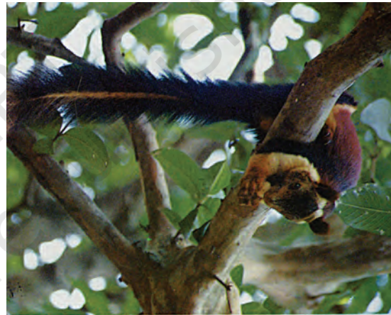
Fig. 7.3 (b) : Giant squirrel

endemic flora of the Pachmarhi Biosphere Reserve. Bison, Indian giant squirrel [Fig. 7.3 (b)] and flying squirrel are endemic fauna of this area. Professor Ahmad explains that the destruction of their habitat, increasing population and introduction of new species may affect the natural habitat of endemic species and endanger their existence.