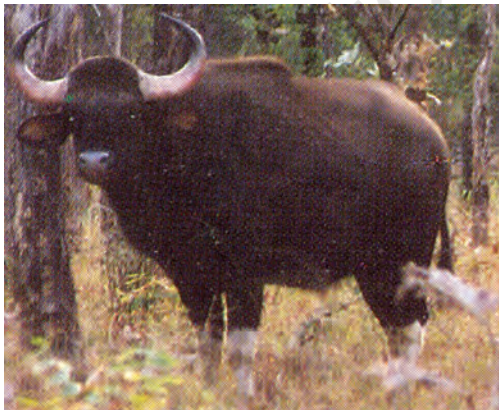
Fig. 7.5 : Wild buffalo

buffaloes (Fig. 7.5) and barasingha (Fig. 7.6) were also found in the Satpura National Park. Animals whose numbers are diminishing to a level that they might face extinction are known as the endangered animals . Boojho is reminded of the dinosaurs which became extinct a long time ago. Survival of some