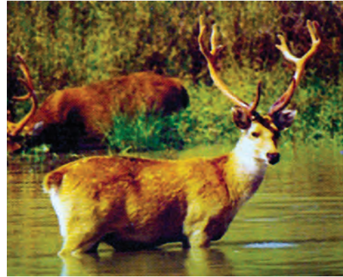
Fig. 7.6 : Barasingha

animals has become difficult because of disturbances in their natural habitat. Professor Ahmad tells them that in order to protect plants and animals strict rules are imposed in all National Parks. Human activities such as grazing, poaching, hunting, capturing of animals or collection of firewood, medicinal plants, etc. are not allowed